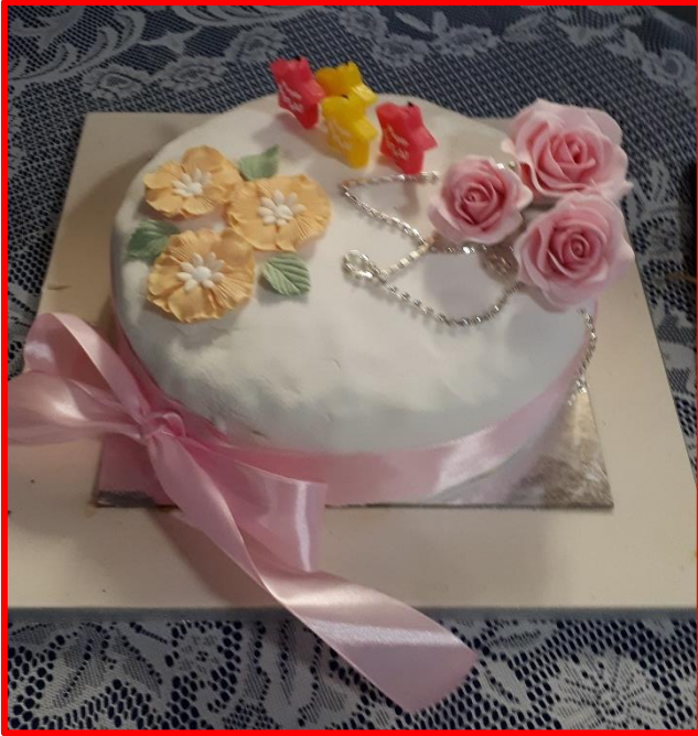
Tina Cutting the cake she made.