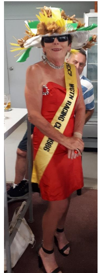
People's choice of Best Dress Punter