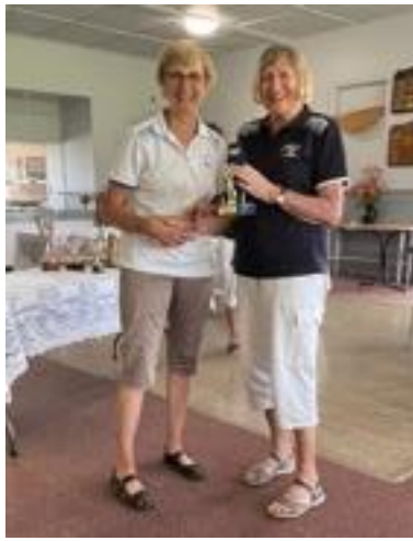
Hilda Saunders Putting Trophy Bronze 2 Harris Trophy Match Play Mike Trott Trophy