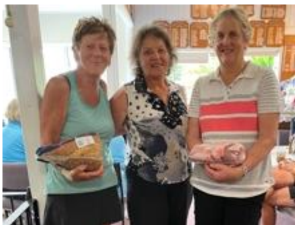
18 Hole winners