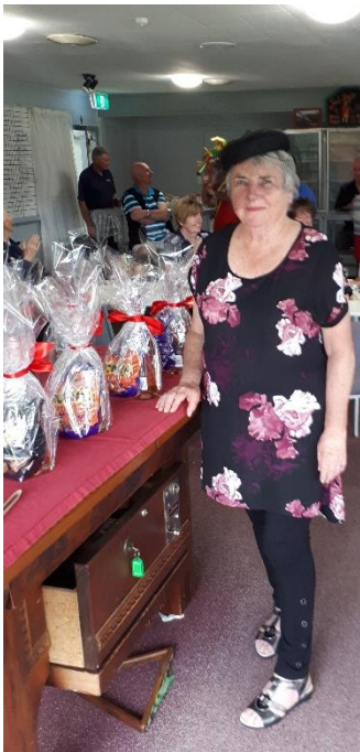
The Prize table