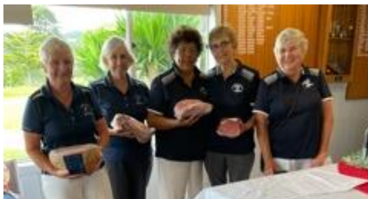
9 Hole 1 st Division winners