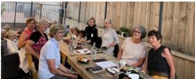
Golf at Waihi