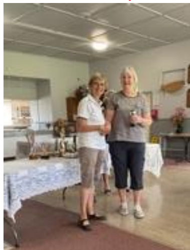
Match Play Bronze 3