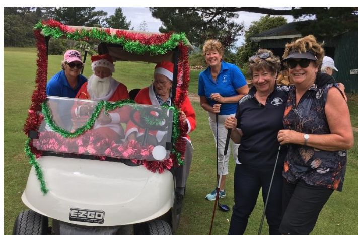
Santa came to play!