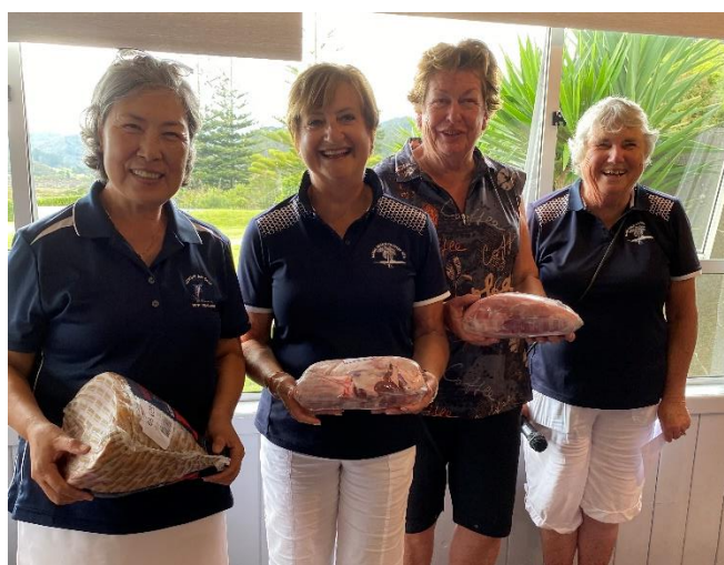
9 Hole 2nd Division winners