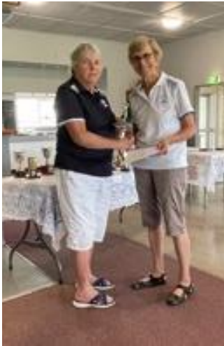
Esther Holden Trophy Stroke Play Bronze 3 Captain's Trophy Wyatt Shootout Cup